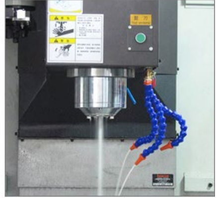
COOLANT THROUGH SPINDLE