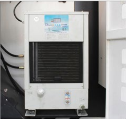
SPINDLE OIL COOLANT