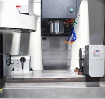
THE 4TH AXIS