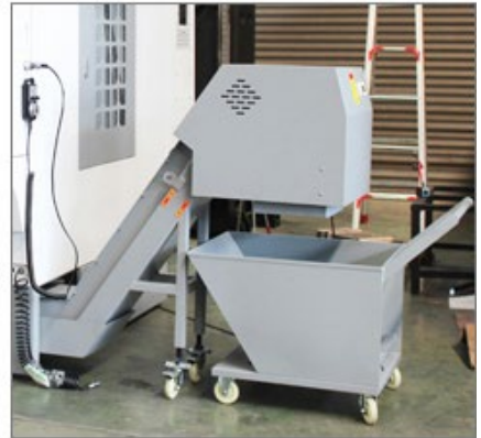
CHAIN TYPE CHIP CONVEYOR